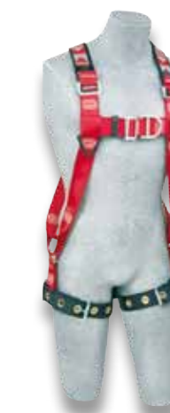
AB12433 (with tongue and grommet buckles)