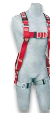
AB12333 (with standard buckles)