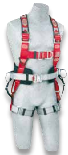
AB126336 (with standard buckles)

Model shown : AB127334 (with tongue and grommet buckles)