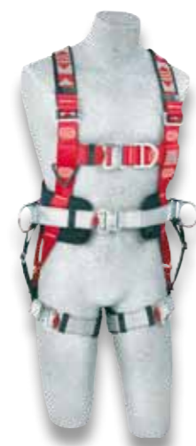
AB128336 (with automatic buckles)